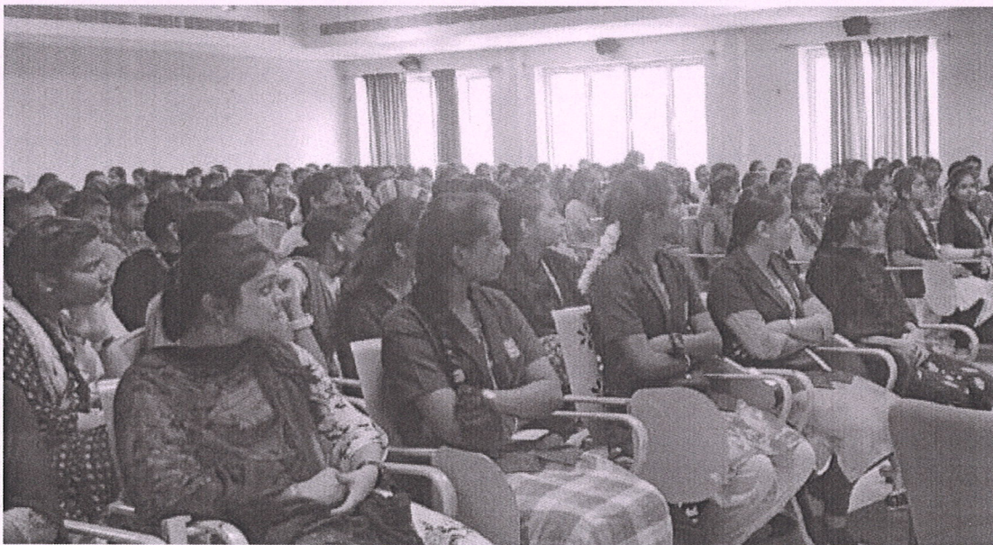
Govt. Hr. Sec. School students - Sendurai